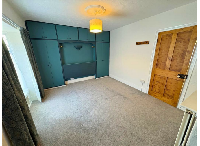
Bedroom One w: 14'11" x l: 10'7" (w: 4.55 x l: 3.23)

Papered ceiling, papered walls, fitted carpet, radiator, uPVC double glazed box bay window to the front.