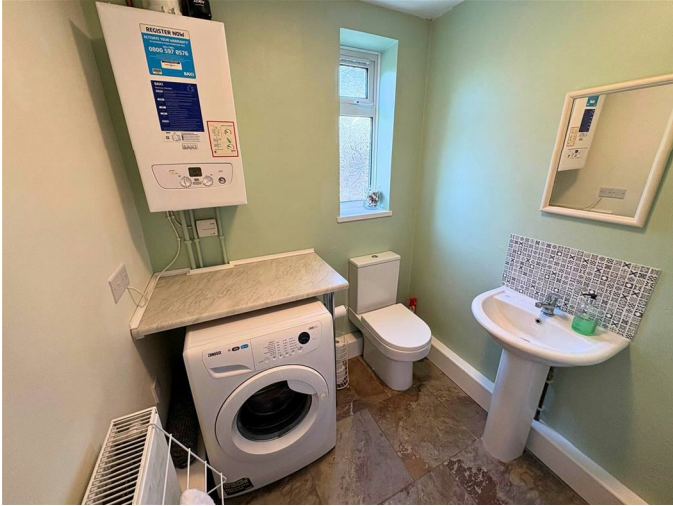
Utility Room / W.C. w: 5'8" x l: 6'1" (w: 1.75 x l: 1.87)

Skimmed ceiling, skimmed walls (with tiled splashback over the wash hand basin), ceramic tiled flooring, radiator, a complementary work surface with space and plumbing for a washing machine beneath, two piece suite comprising a pedestal wash hand basin and a low level W.C., wall mounted gas combination boiler, uPVC double glazed window with obscured glass to the rear.