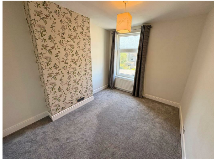
Bedroom Two w: 7'7" x l: 11'1" (w: 2.33 x l: 3.38)

Skimmed ceiling, skimmed and papered walls, fitted carpet, radiator, uPVC double glazed window to the rear.